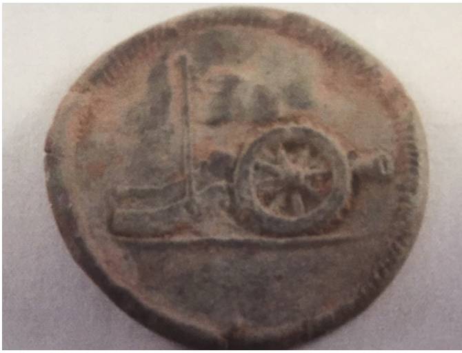
Artillery uniform button unearthed at Fort Wyllis.