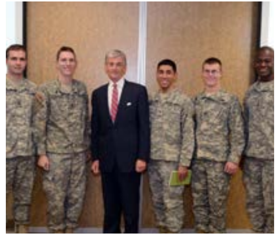
From left to right: Cadets during the Academy's Projects Day, demonstrating their research through the CRC in fiber optic communications; the CRC's Cyber Defense Exercise cadets decide how to defend against the aggressors; Secretary of the Army John McHugh with the 2014 Cyber Defense Exercise leadership team.