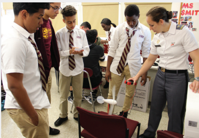
Students work with Cadets during a Renewable Energy workshop at Eximius College Preparatory Academy in New York City.