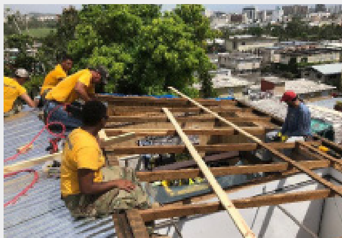
Cadet Gospel Choir, Cultural Affairs Seminar (CAS), National Society of Black Engineers (NBSE), and Excel Scholars focused on rebuilding roofing systems in the Pueblo community in San Juan, Puerto Rico.